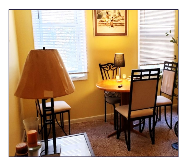
A living room in one of our SIL apartments

"I can remember sleeping in my own bed and thinking how long I had been homeless on the streets."