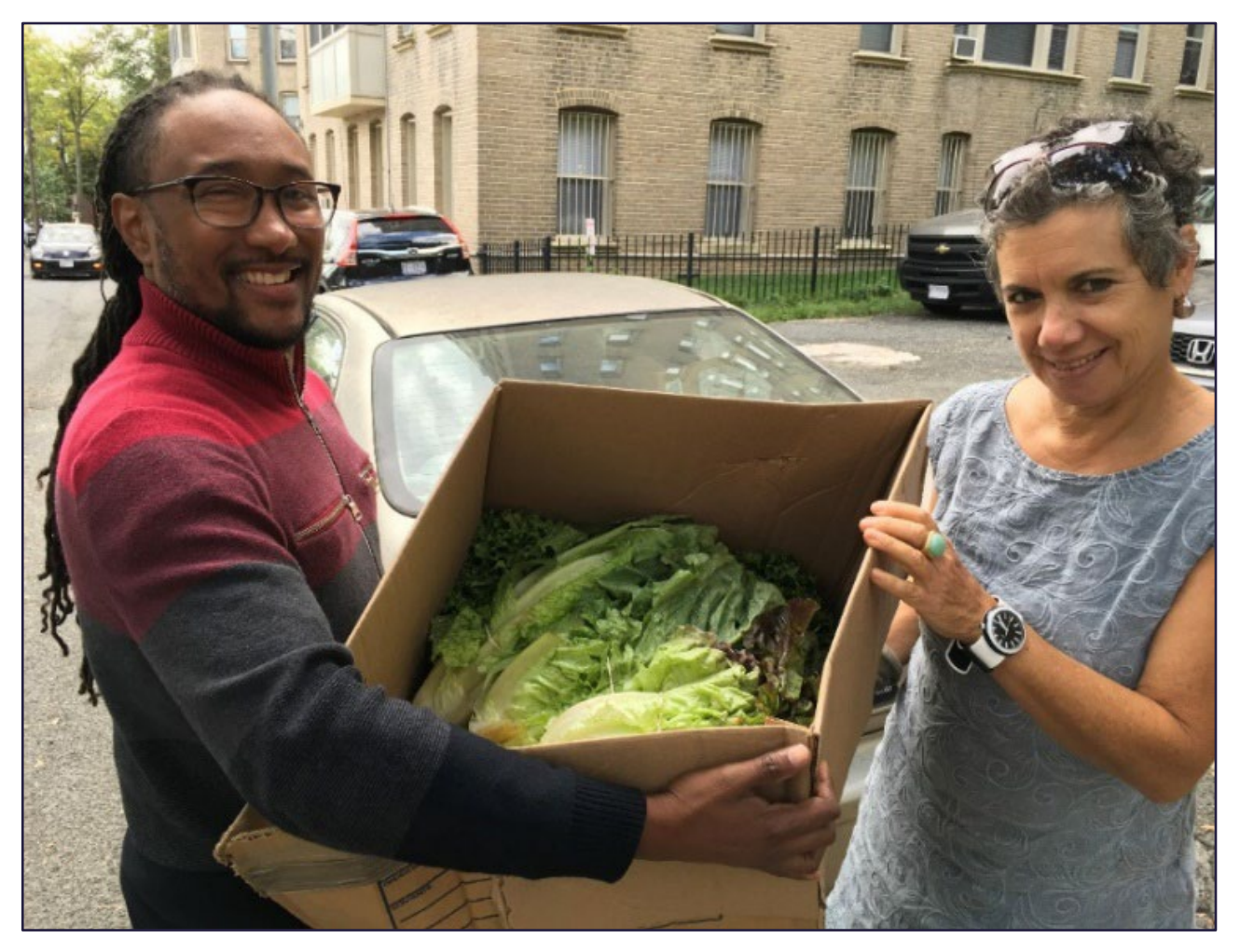
A pre-pandemic volunteer from Food Rescue US