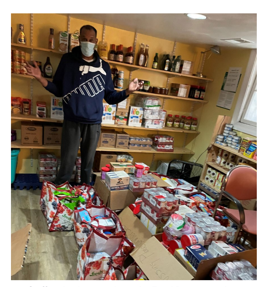
Staff and volunteers keep the Food Pantry running.

Our Food Pantry started in 2011 and is part of the fabric of our community. Open every Tuesday afternoon, we offer food staples and bagged groceries to our SIL apartment residents, as well as our DC neighbors-in-need. Although we were forced to close from March until August because of the pandemic, we were able to serve 65 households, 65% of whom were our DC neighbors, the rest were in our SIL program. As we are aware of the tremendous need, we are looking to expand outreach and access to food for those in DC experiencing food insecurity.